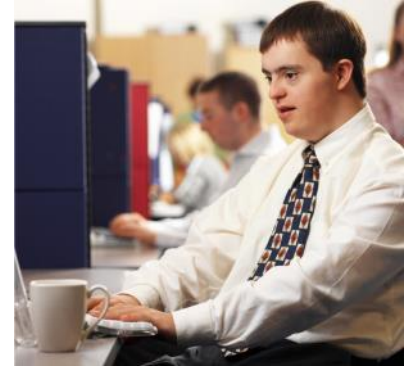
Figure out what website you might want to use. You have probably seen many commercials about online dating websites, like eHarmony.com , match.com , etc. You might want to ask people you know who have used them what they think. I used eHarmony and it worked for me, but there are different people on different sites.

M any young adults with disabilities are looking for ways to meet other people and start dating. I know a lot of young adults have trouble finding people to date that they can meet in person, so online dating becomes an option. I personally met my husband online so I have some suggestions on how to do so safely and hopefully make it work for you! Here are my tips for healthy, fun online dating!